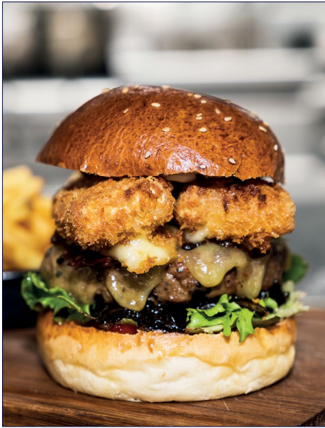
Jones signature Wagyu burger with crispy coated brie