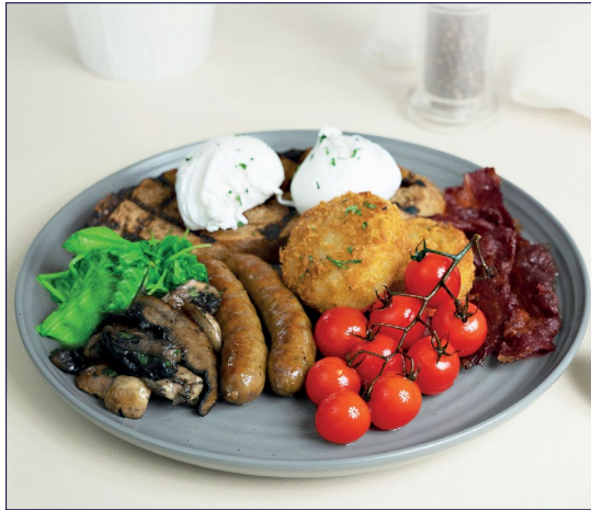
Jones traditional English breakfast