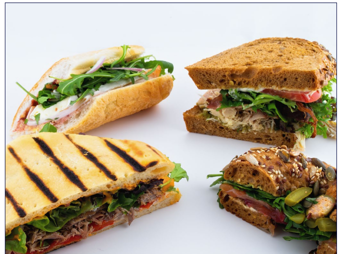
Sandwiches and wraps