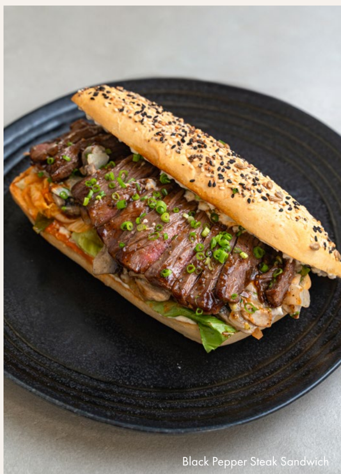
Black Pepper Steak Sandwich

N - Nuts | V - Vegetarian | GF - Gluten Free | G - Gluten | D - Dairy | E - Eggs | SP - Sulphates | SO - Soy Beans S - Fish and or Shellfish | P - Peanut | SE - Sesame | M - Mustard | C - Celery | A - Alcohol