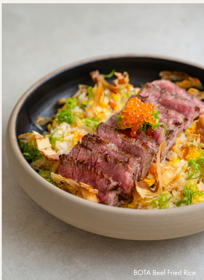
BOTA Beef Fried Rice