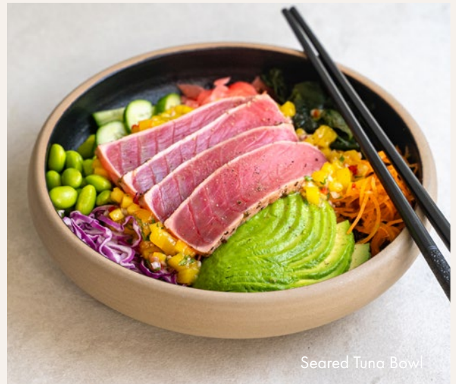
Seared Tuna Bowl