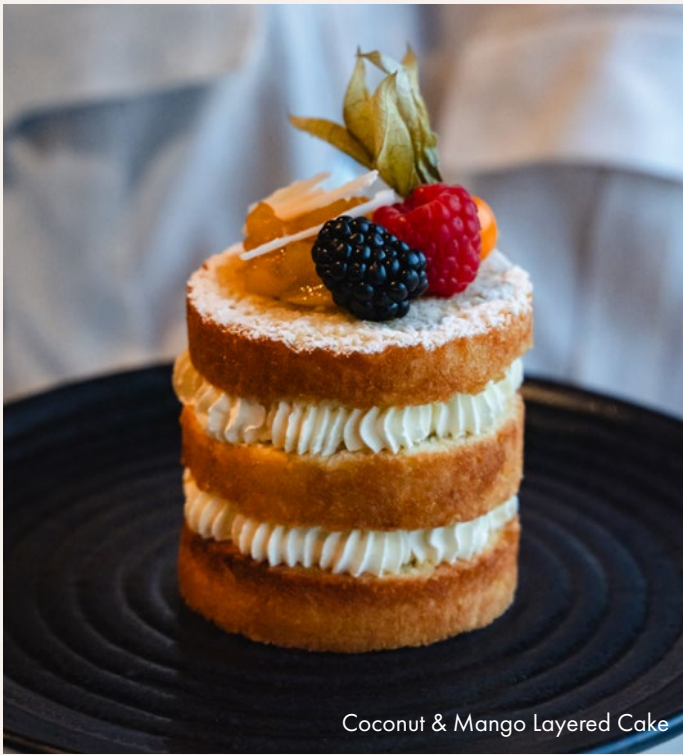
Coconut & Mango Layered Cake