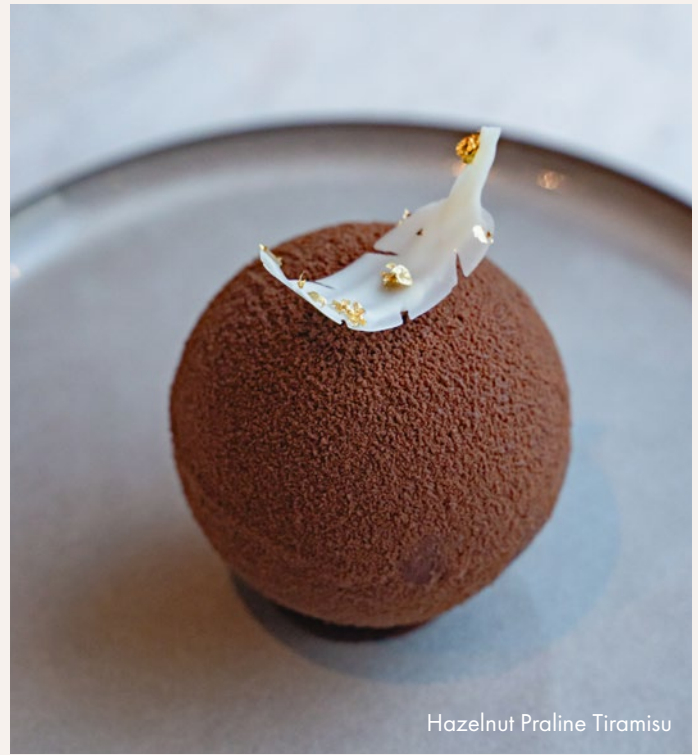
Hazelnut Praline Tiramisu