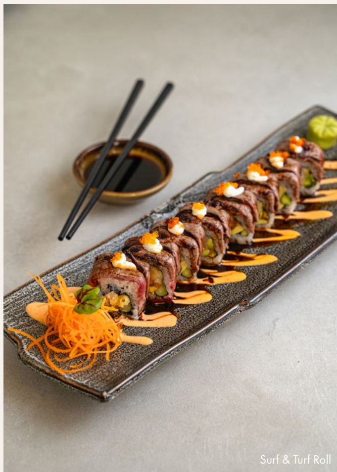
Surf & Turf Roll

N - Nuts | V - Vegetarian | GF - Gluten Free | G - Gluten | D - Dairy | E - Eggs | SP - Sulphates | SO - Soy Beans