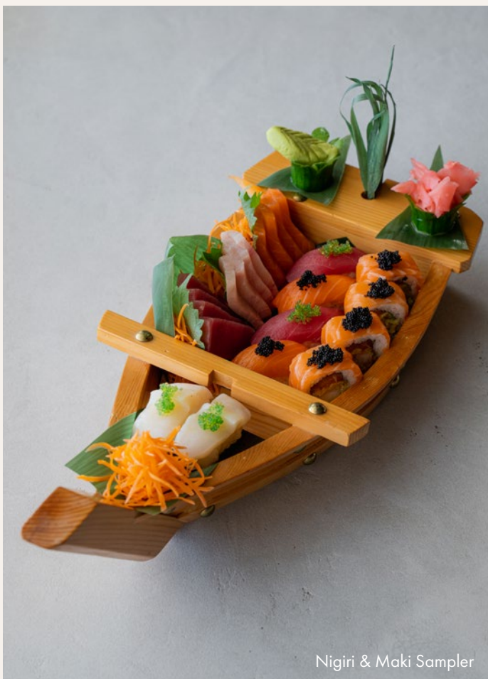
Nigiri & Maki Sampler

Wagyu beef, tempura prawn, avocado, asparagus, cream cheese, tobiko, teriyaki & spicy sauce